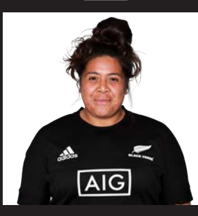
TEAM: Auckland DOB: 28.06.91 CAPS: 20 IWI: N/A