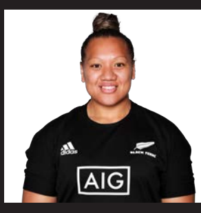
TEAM: Waikato DOB: 22.11.91 CAPS:22 IWI: N/A