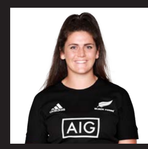
TEAM: Canterbury DOB: 11.04.95 CAPS: 0 IWI: N/A