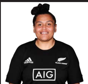
TEAM: Northland DOB: 21.10.91 CAPS: 30 IWI: Ngāti Porou