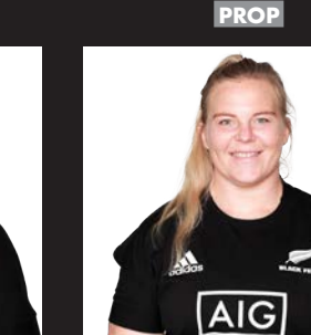
TEAM: Canterbury DOB: 09.04.90 CAPS: 11 IWI: N/A