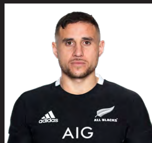
TJ PERENARA HALFBACK

TEAMS: Hurricanes / Wellington DOB: 23.01.92 CAPS: 64 HEIGHT: 1.84m WEIGHT: 94kg