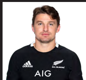
BEAUDEN BARRETT FIRST FIVE-EIGHTHS

TEAMS: Blues / Taranaki DOB: 27.05.91 CAPS: 84 HEIGHT: 1.87m WEIGHT: 91kg