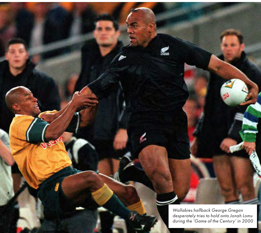
Wallabies halfback George Gregan desperately tries to hold onto Jonah Lomu during the 'Game of the Century' in 2000