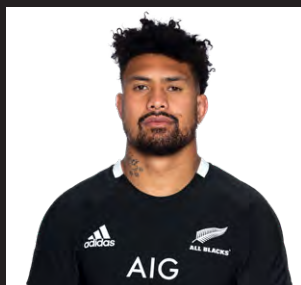
ARDIE SAVEA LOOSE FORWARD

TEAMS: Hurricanes / Wellington DOB: 14.10.93 CAPS: 44 HEIGHT: 1.9m WEIGHT: 99kg