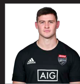
FIRST PROVINCE: Auckland DOB: 11.10.97 HEIGHT: 1.93m WEIGHT: 113kg