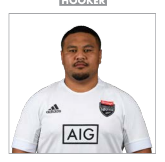
FIRST PROVINCE: Wairarapa-Bush DOB: 22.01.92 HEIGHT: 1.82m WEIGHT: 128kg