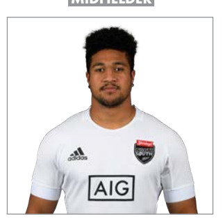
FIRST PROVINCE: Tasman DOB: 11.10.99 HEIGHT: 1.88m WEIGHT: 109kg