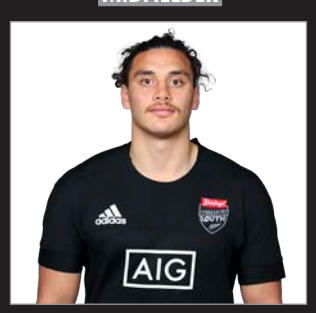
FIRST PROVINCE: Wellington DOB: 31.12.97 HEIGHT: 1.87m WEIGHT: 102kg