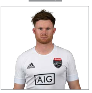
FIRST PROVINCE: Canterbury DOB: 15.02.94 HEIGHT: 1.80m WEIGHT: 88kg