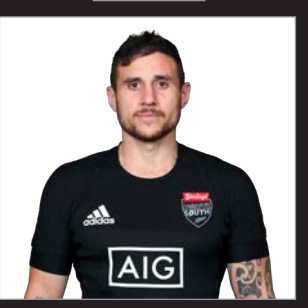
FIRST PROVINCE: Wellington DOB: 23.01.92 WEIGHT: 94kg HEIGHT: 1.84m