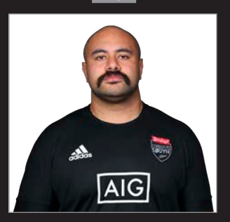
FIRST PROVINCE: North Harbour DOB: 21.02.93 HEIGHT: 1.86m WEIGHT: 135kg