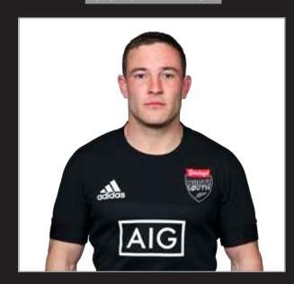
FIRST PROVINCE: Auckland DOB: 19.06.95 HEIGHT: 1.79m WEIGHT: 88kg