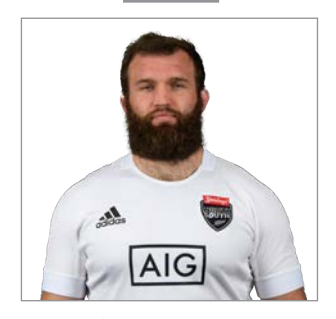
FIRST PROVINCE: Otago DOB: 25.01.90 HEIGHT: 1.85m WEIGHT: 109kg