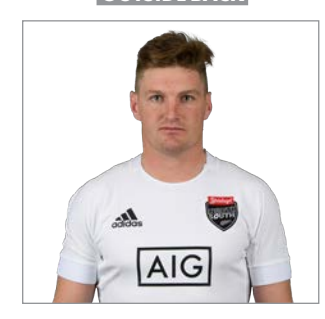
FIRST PROVINCE: Canterbury DOB: 15.02.97 HEIGHT: 1.96m WEIGHT: 95kg