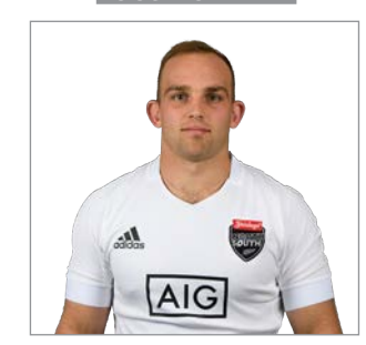
FIRST PROVINCE: Canterbury DOB: 04.03.98 HEIGHT: 1.86m WEIGHT: 105kg