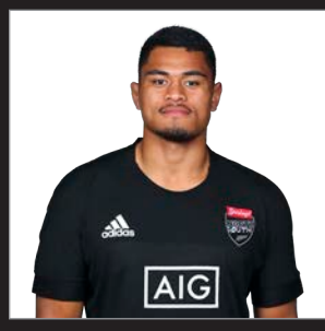
FIRST PROVINCE: Taranaki DOB: 27.01.00 HEIGHT: 1.98m