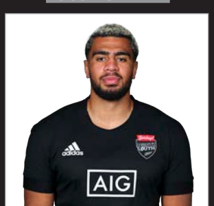
FIRST PROVINCE: Auckland DOB: 12.07.98 WEIGHT: 106kg HEIGHT: 1.92m