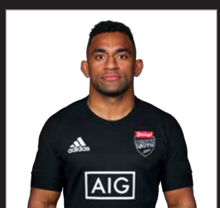
FIRST PROVINCE: Waikato DOB: 13.02.97 HEIGHT: 1.79m WEIGHT: 87kg