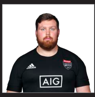
FIRST PROVINCE: Waikato DOB: 24.10.96 HEIGHT: 1.84m WEIGHT: 120kg