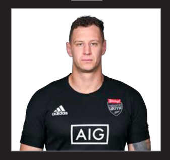
FIRST PROVINCE: Auckland DOB: 18.04.93 HEIGHT: 2.00m WEIGHT: 118kg