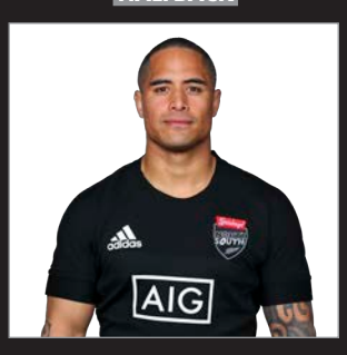
FIRST PROVINCE: Manawatu DOB: 21.11.88 WEIGHT: 83kg HEIGHT: 1.71m