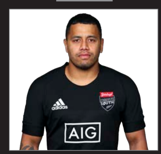
FIRST PROVINCE: Taranaki DOB: 31.03.95 WEIGHT: 85kg HEIGHT: 1.74m