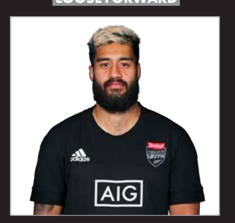
FIRST PROVINCE: Auckland DOB: 16.06.95 HEIGHT: 1.94m WEIGHT: 113kg