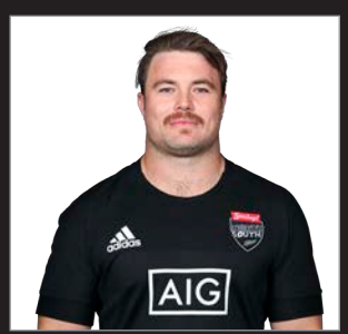
FIRST PROVINCE: Auckland DOB: 05.01.92 HEIGHT: 1.80m WEIGHT: 103kg