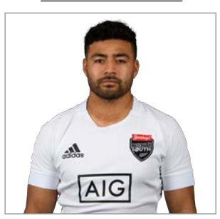
FIRST PROVINCE: Canterbury DOB: 25.05.94 HEIGHT: 1.76m WEIGHT: 83kg