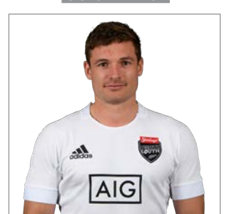
FIRST PROVINCE: Canterbury DOB: 01.04.95 HEIGHT: 1.86m WEIGHT: 96kg