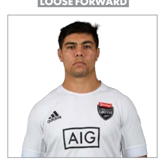
FIRST PROVINCE: Canterbury DOB: 17.02.93 HEIGHT: 1.92m WEIGHT: 108kg