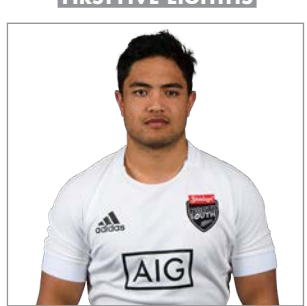
FIRST PROVINCE: Otago DOB: 11.07.95 HEIGHT: 1.76m WEIGHT: 85kg