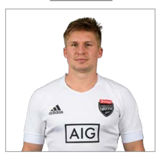
FIRST PROVINCE: Canterbury DOB: 13.06.95 HEIGHT: 1.87m WEIGHT: 100kg