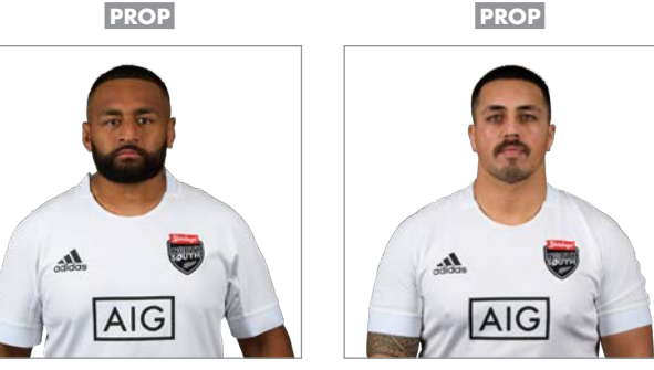
FIRST PROVINCE: Canterbury DOB: 09.02.93 HEIGHT: 1.84m WEIGHT: 109kg