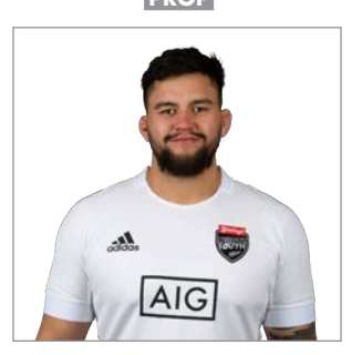
FIRST PROVINCE: Tasman DOB: 16.03.96 HEIGHT: 1.93m WEIGHT: 127ka