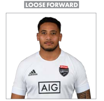
FIRST PROVINCE: Tasman DOB: 11.02.94 HEIGHT: 1.95m WEIGHT: 108kg