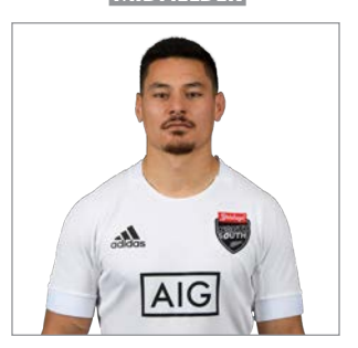
FIRST PROVINCE: Otago DOB: 27.05.96 HEIGHT: 1.82 m WEIGHT: 94 kg