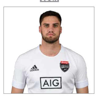
FIRST PROVINCE: Southland DOB: 05.06.96 HEIGHT: 2.00m WEIGHT: 112kg