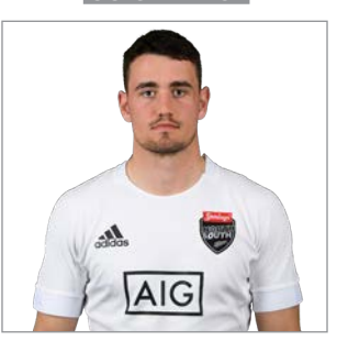
FIRST PROVINCE: Tasman DOB: 24.02.98 HEIGHT: 1.88m WEIGHT: 94kg