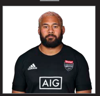
FIRST PROVINCE: Auckland DOB: 23.01.93 WEIGHT: 120kg HEIGHT: 1.98m