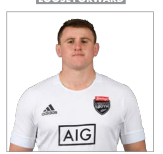
FIRST PROVINCE: Canterbury DOB: 05.02.94 HEIGHT: 1.90m WEIGHT: 110kg