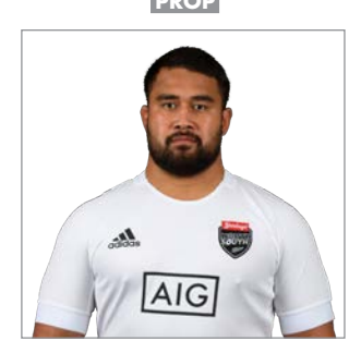
FIRST PROVINCE: Canterbury DOB: 06.11.91 HEIGHT: 1.84m WEIGHT: 116kg