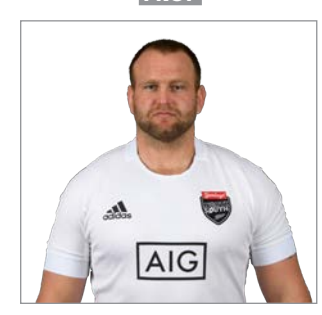
FIRST PROVINCE: Canterbury DOB: 18.09.88 HEIGHT: 1.88m WEIGHT: 120ka