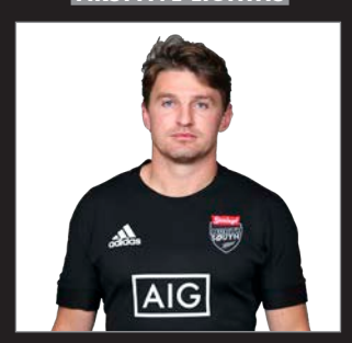
FIRST PROVINCE: Taranaki DOB: 27.05.91 WEIGHT: 91kg HEIGHT: 1.87m