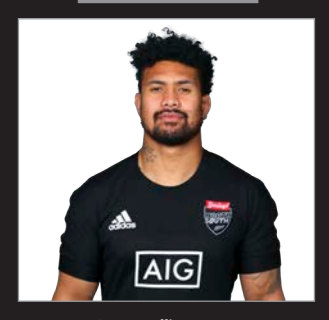
FIRST PROVINCE: Wellington DOB: 14.10.93 HEIGHT: 1.90m WEIGHT: 99kg