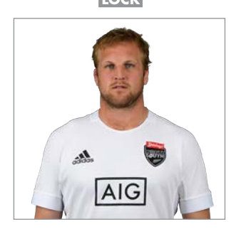
FIRST PROVINCE: Canterbury DOB: 18.11.95 HEIGHT: 1.97m WEIGHT: 115kg