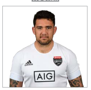
FIRST PROVINCE: Canterbury DOB: 31.03.91 HEIGHT: 1.83m WEIGHT: 108kg