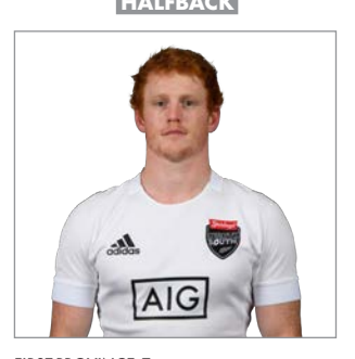
FIRST PROVINCE: Tasman DOB: 19.09.94 HEIGHT: 1.77m WEIGHT: 82kg