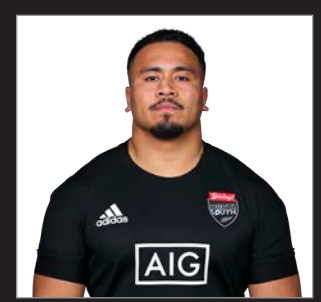
FIRST PROVINCE: Wellington DOB: 05.05.97 HEIGHT: 1.77m WEIGHT: 108kg