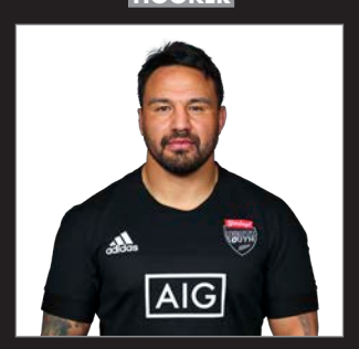
FIRST PROVINCE: Hawke's Bay DOB: 01.09.88 HEIGHT: 1.82m WEIGHT: 102kg