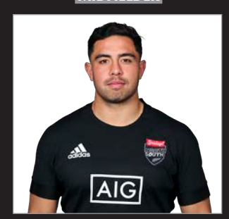
FIRST PROVINCE: Waikato DOB: 15.04.95 HEIGHT: 1.85m WEIGHT: 96kg