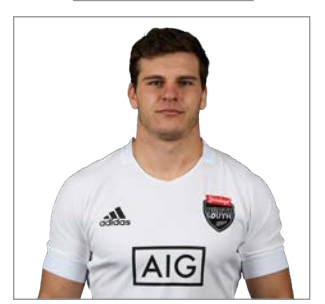
FIRST PROVINCE: Otago DOB: 23.02.95 HEIGHT: 1.89m WEIGHT: 103kg