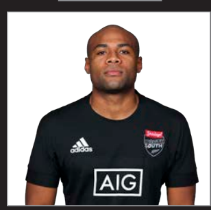
FIRST PROVINCE: North Harbour DOB: 06.12.96 HEIGHT: 1.86m WEIGHT: 94kg