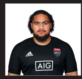
FIRST PROVINCE: Auckland DOB: 19.04.92 WEIGHT: 122kg HEIGHT: 1.95m