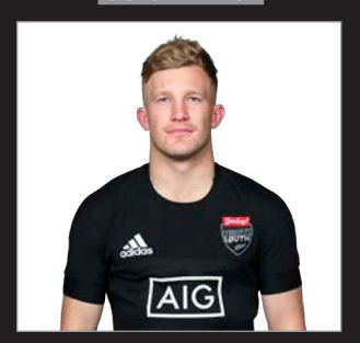
FIRST PROVINCE: Waikato DOB: 20.05.95 WEIGHT: 81kg HEIGHT: 1.75m