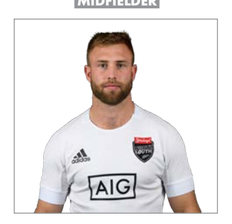
FIRST PROVINCE: Canterbury DOB: 16.07.97 HEIGHT: 1.87m WEIGHT: 94kg