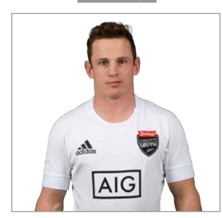
FIRST PROVINCE: Otago DOB: 17.01.91 HEIGHT: 1.72m WEIGHT: 75kg