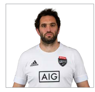
FIRST PROVINCE: Canterbury DOB: 12.10.88 HEIGHT: 2.02m WEIGHT: 116kg