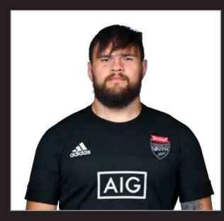
FIRST PROVINCE: Auckland DOB: 22.03.90 HEIGHT: 1.94m WEIGHT: 124kg